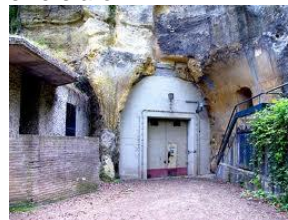
JOC Maastricht (Holland)

Reaction to this was disappointing - only four replies - thanks to those who responded. However, no-one got the first one right! Answers are: