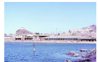
RAF Steamer Point (Lido Beach)